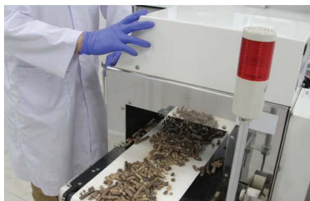
Metal screening for wood pellets

Contact us to learn more about our services and how we can assist you with your biomass analysis needs.